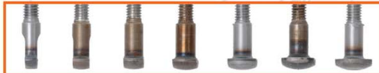
4,5mm 6mm 7,5mm 9mm 10,5mm 12mm 13,5mm Width of pointing pin

Raked mortar joints are the trend of today. This style of brick joint is homogeneous, stronger and better looking. No wonder that architects prefer this joint to concave or extruded styles. With Easypointer® you can reduce time consumption. Raking & shaping excess mortar in only one movement.